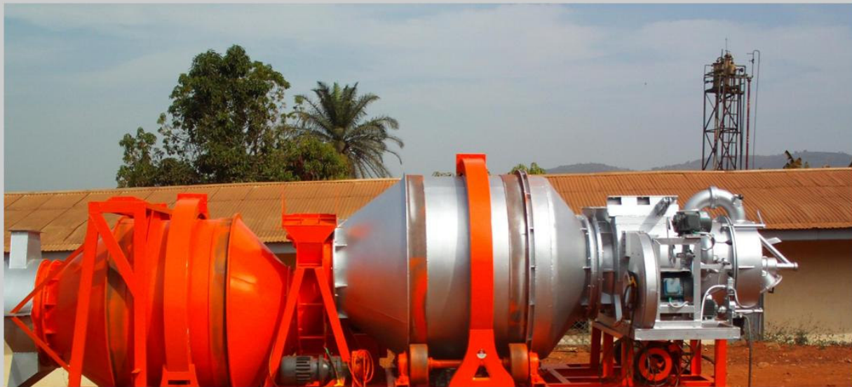
HRODC_AP15 10TPH Asphalt Plant — Part Installed Without Options