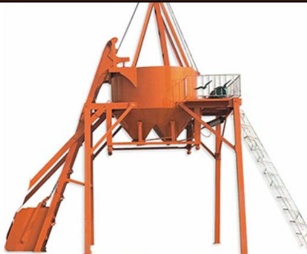
Finished Elevator System

Human Resource and Organisational Development Consultancy (HRODC) Ltd. Registered in England No. 6088763.